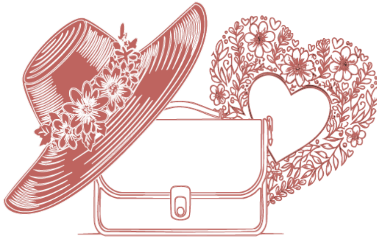
TABLE CAPTAIN'S GUIDE